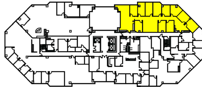
KEY PLAN 3,974 RSF