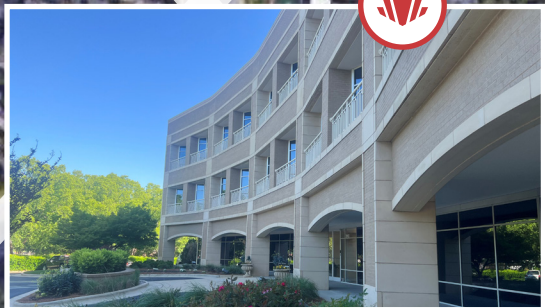
3110 EDWARDS MILL ROAD