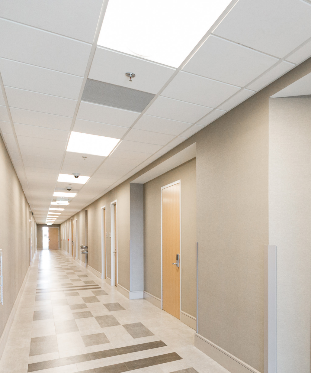
Efficient common areas with independent tenant suites.