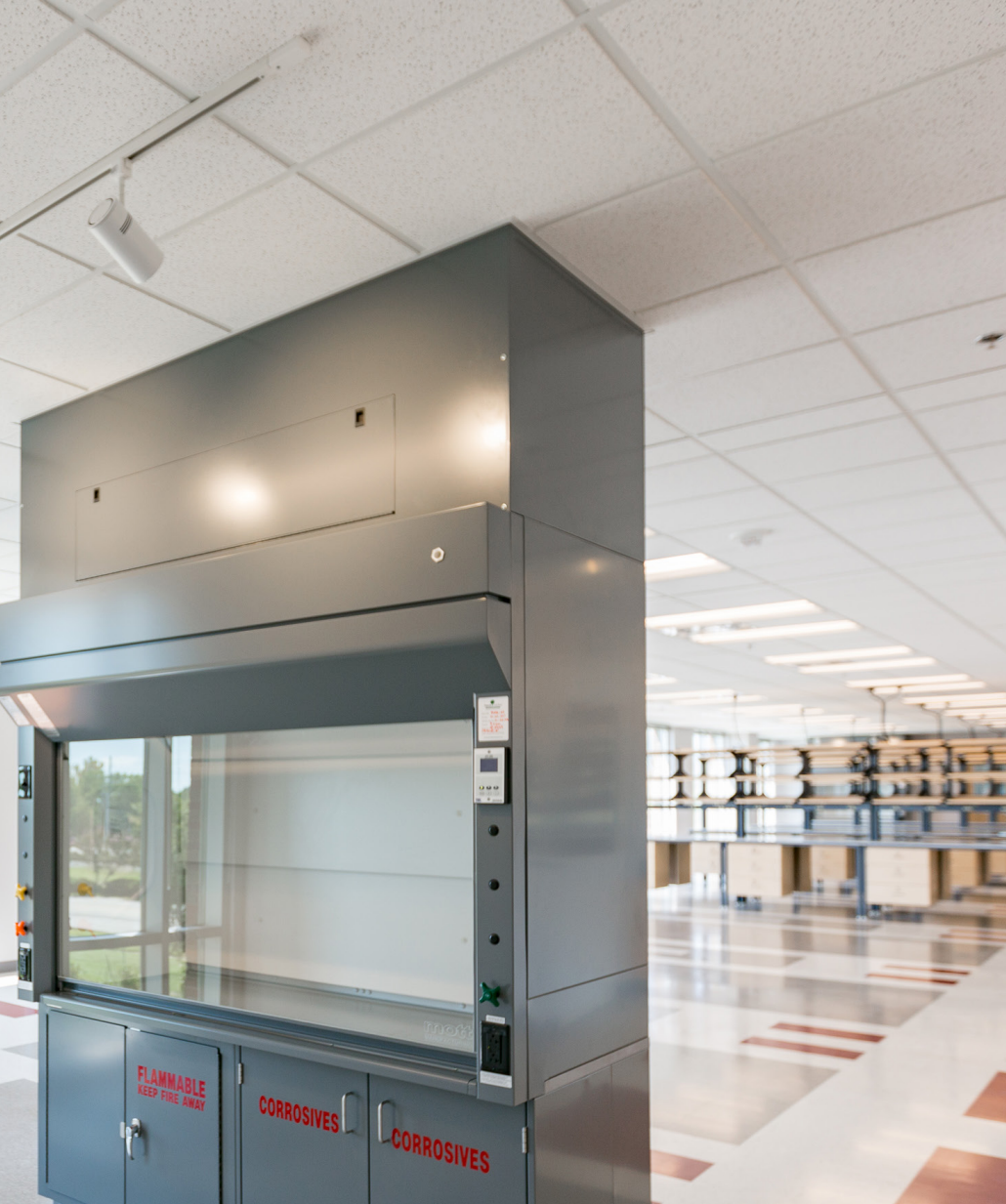
Building infrastructure existing for BSL2 designation in lab spaces.