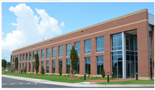
Biomedical Partnership Center