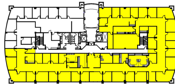
KEY PLAN 14,501 RSF