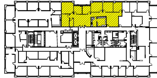
KEY PLAN 2,792 RSF

1450 Raleigh Road | Chapel Hill, NC 27517