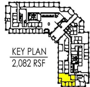
KEY PLAN 2,082 RSF