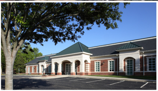
WAKEFIELD HEALTH PARK