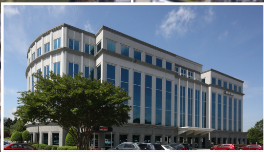
800 GREEN VALLEY ROAD