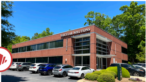
1000 CRESCENT GREEN